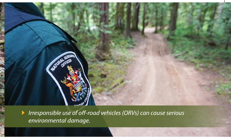
▶ Irresponsible use of off-road vehicles (ORVs) can cause serious environmental damage.