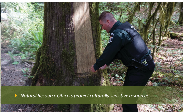
▶ Natural Resource Officers protect culturally sensitive resources.