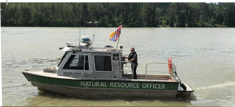
▶ Natural Resource Officers often inspect timber operations, foreshore developments and water authorizations by boat.